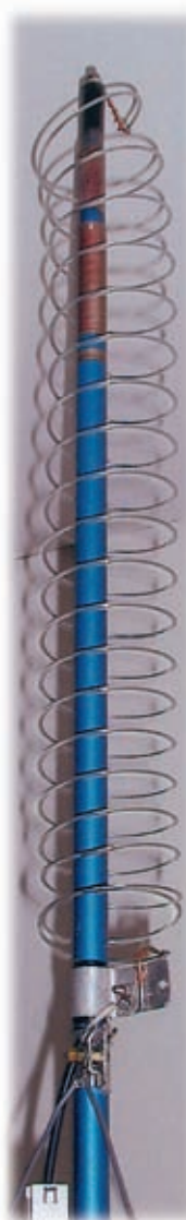
● Fig. 3: Compare this photograph with the illustration of Fig. 2.

The Slinky was extended to cover just half a metre, the same length as a \lambda/4 vertical for the 144MHz band. The feed-point impedance however, depends on the layout of the two ground radials. I also